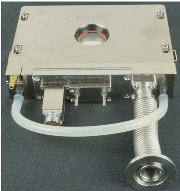
Optional Cryo Stage