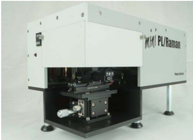
Mini PL/Raman with optional X-Y motorized stage