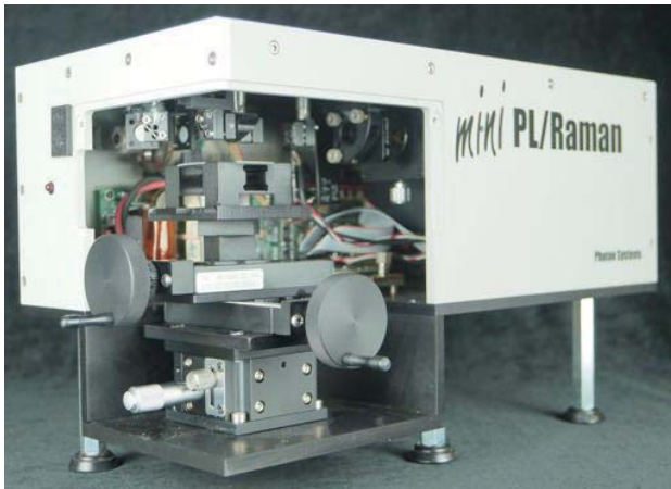
The Mini PL/Raman standard configuration has a high precision manual stage