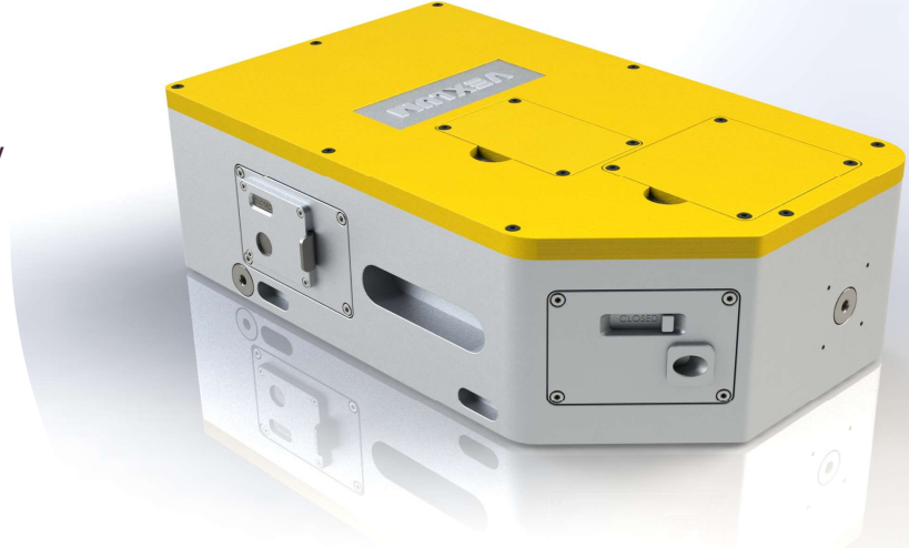
Vertical-external-cavity surface-emitting laser (VECSEL) a.k.a. Optically pumped semiconductor laser (OPSL)