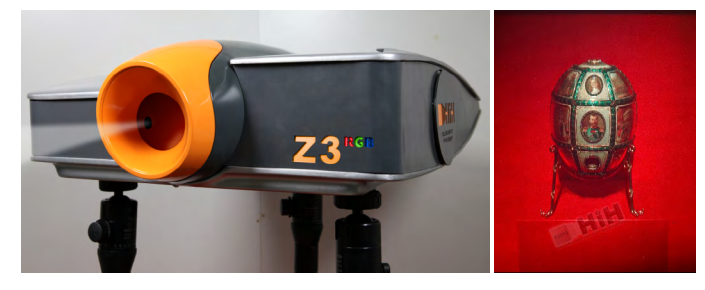
Figure 2: (L) An example of a portable holographic system called ZZZyclops developed at Hellenic Institute of Holography in Greece and (R) an example of a hologram written with the ZZZyclops.

As anticipated, such detailed replicas can be used as a secure way of marking high value goods and thus have found applications in the security market i.e. banking and pharmaceutical applications. In addition to the security markets, the application of archiving antiquities is a growing area. Artefacts which are too old to be transported or too valuable to leave the museum can now be re-created using the white light holography and the holograms can 'go on tour'. In this case, a portable holographic system travels to the artefacts for documentation.